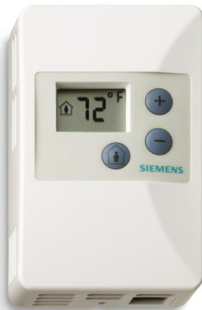
Figure 1. WRTS (Full-Featured Model).

Since the WFLN is a mesh network, a WRTS can use any nearby FLNX to communicate with its TEC.