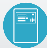
Voice-Enabled Fire Panels

Siemens Industry, Inc. Building Technologies Division 1000 Deerfield Parkway Buffalo Grove, IL 60089 Tel. (847) 215-1000