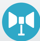
IP Networked Loud Speakers