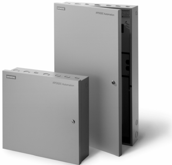
Figure 3. Two sizes of Power BACnet Modular Equipment Controller enclosures.

The enclosures are constructed of metal to accommodate secure conduit fittings and protect components against electrical transients. The enclosure allows space for easy wire routing and terminations.