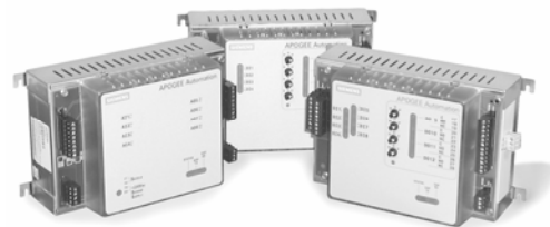
Figure 5. Analog and Digital Point Expansion Modules.

The digital inputs are dry contact with four of the inputs being pulse accumulator points. The relayed digital output points support 110/220V Form C relays.