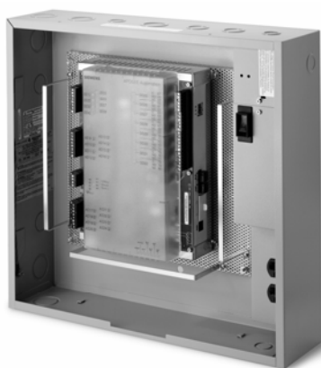
Figure 1. Power BACnet Modular Equipment Controller in small enclosure with service box.