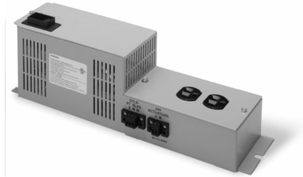
Figure 4. Power BACnet Modular Equipment Controller service box.

Two optional service boxes are available for mounting in the enclosure. One service box provides step down power from 115V to 24V, two Class 2 24 Vac power terminations (100 VA for Power BMEC and Point Expansion Modules, and 60 VA for actuators), and two unswitched 115 Vac outlets to power accessory devices such as modems and Portable Operator's Terminals. A second service box provides step down power from 230V to 24V and Class 2 24 Vac power terminations.