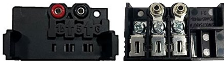
ACEND-ADPT (front and back)

Note: Only one adapter is needed per DPU or FFA, not per notification appliance.